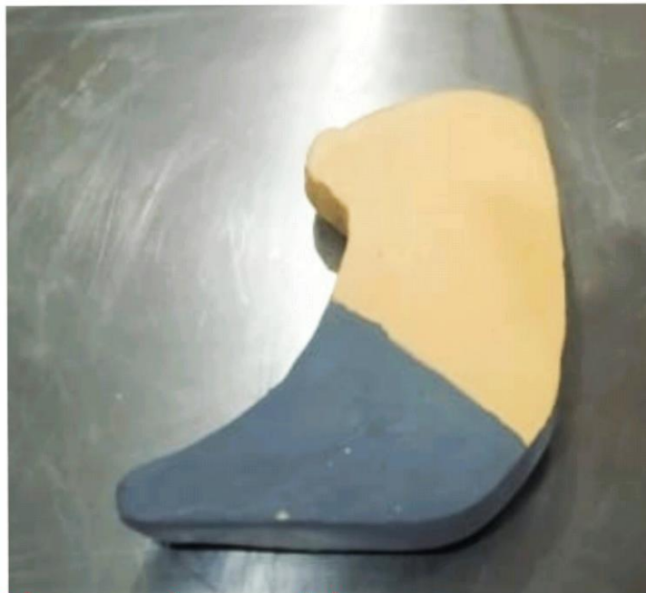
Almost done with some more colouring after drying process