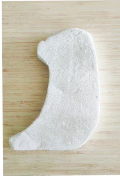
POP Stomach Cast