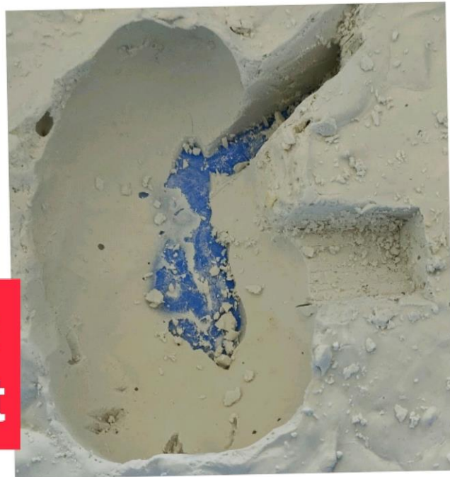
Prepared in Department