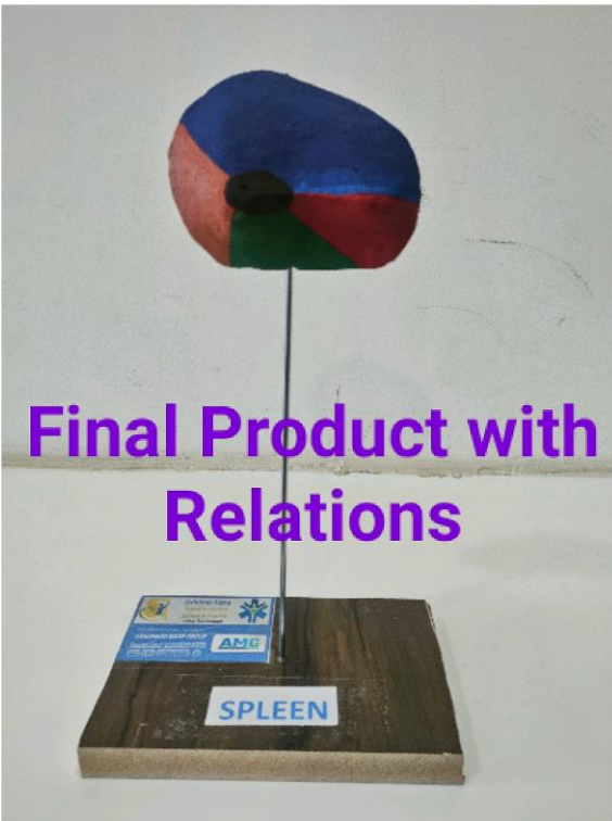
Final Product with Relations