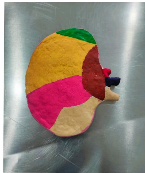
Kidney Cast (Model)