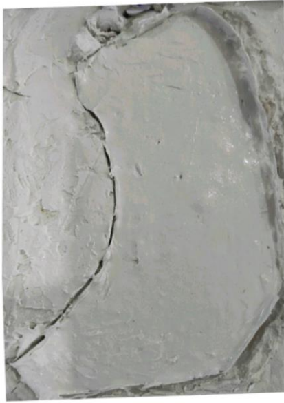
POP Stomach Mould